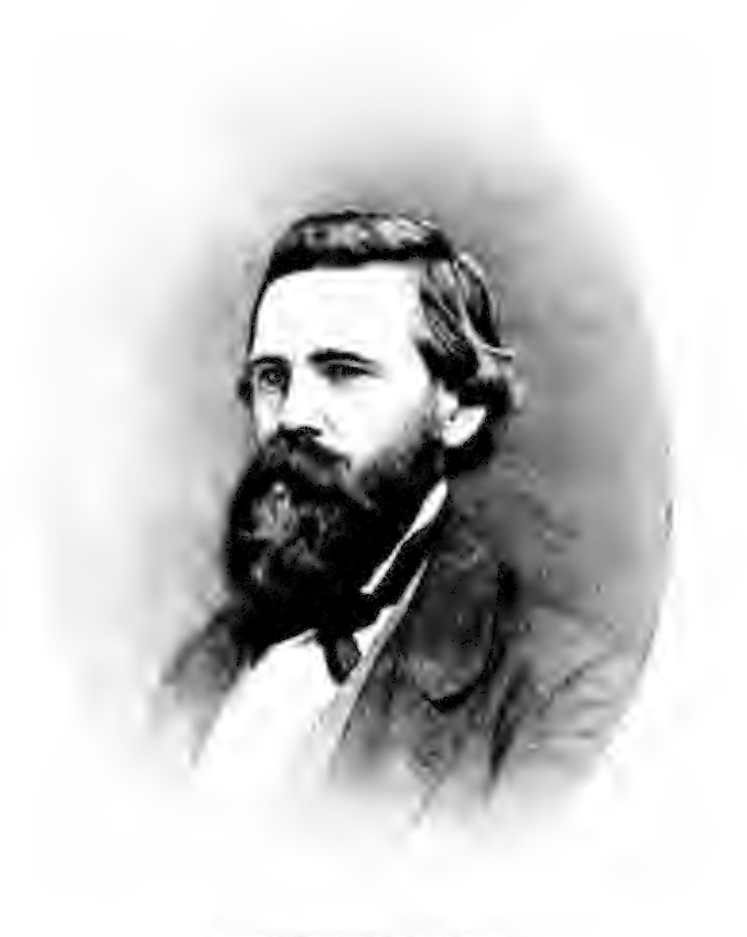
COLONET RICHARD A. OAKFORD Killed at Daule of Anticram, September 17, 1862